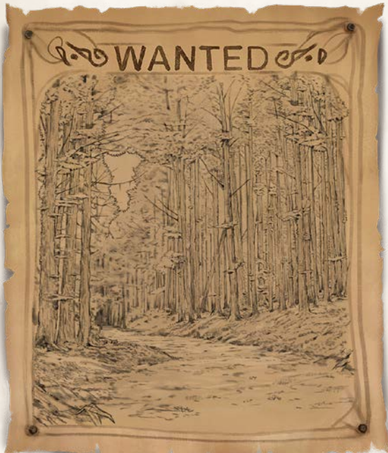
Road Bounty Poster